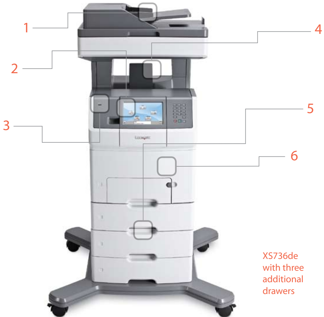
X5736de with three additional drawers