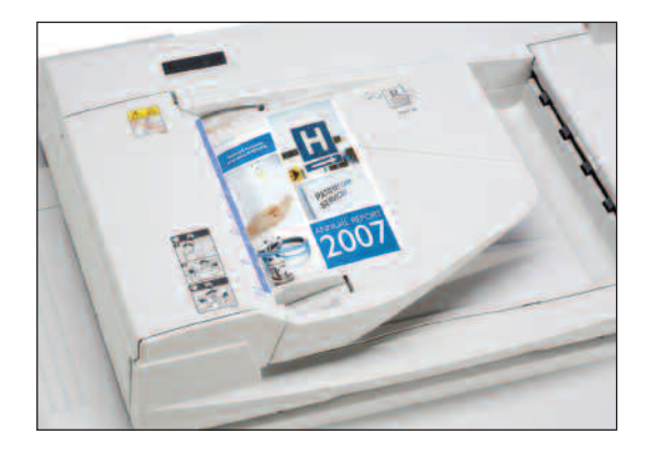
Scan, preview and distribute full-color documents across your organization in seconds with color Scan-to-Email capabilities.